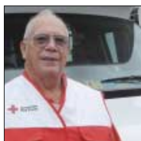
Helping Others Saving Lives front page

In partnership with the Richmond Times Dispatch , the Chapter received more than 3,000 letters from youth writing to console children affected by Hurricanes Katrina and Rita. This message reads: "We are sending are best! We are trying too do are best! from me"