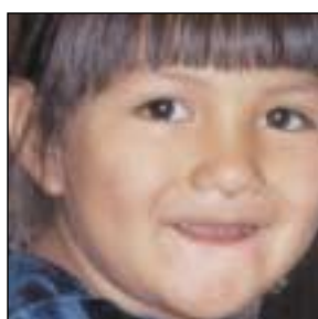
Web of Hope Working Together page 2