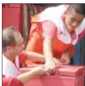
Partners Hispanic Communities page 7

Special thanks to our generous supporters.